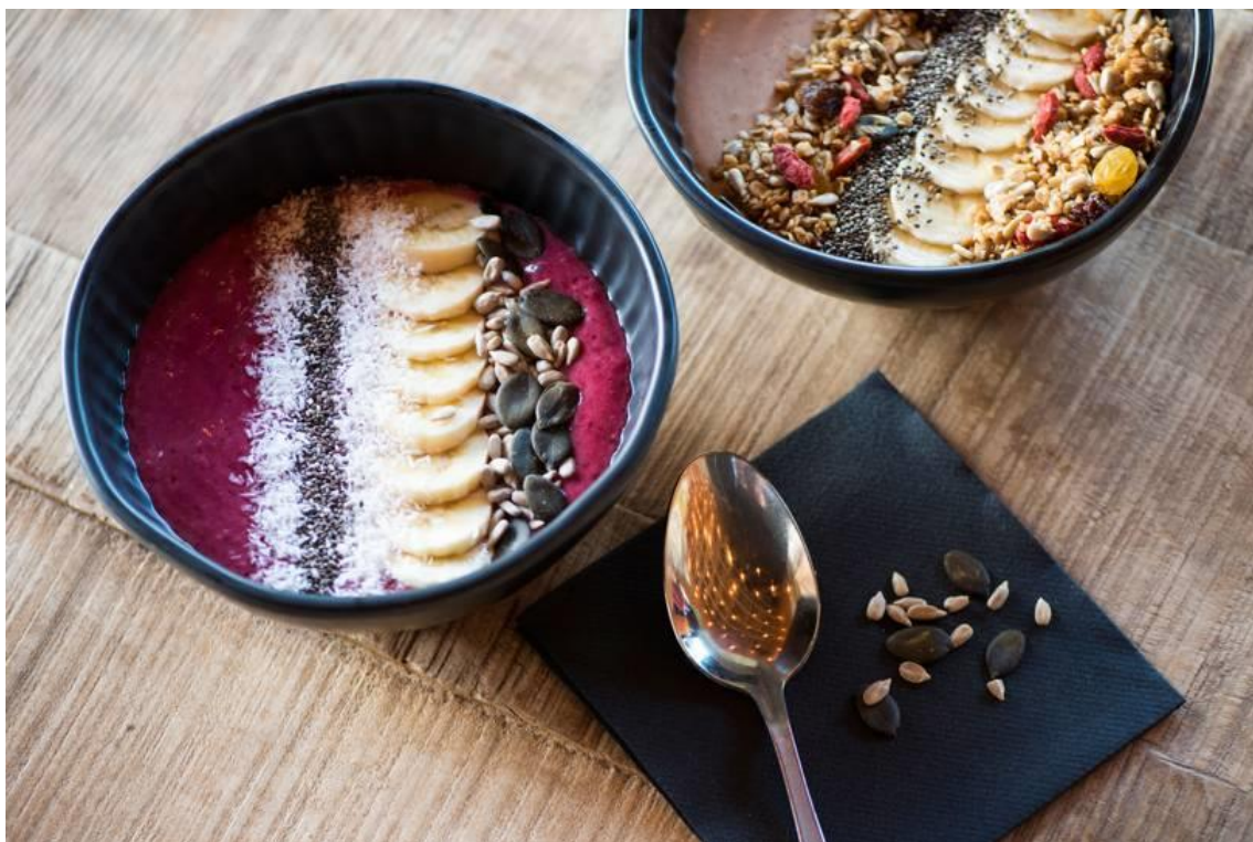
Arctic Juice and Café